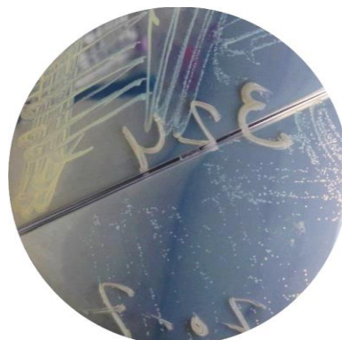
(Figure 3) Three days old Mueller-Hinton agar plate shows a growth of the isolated Brucella spp.

However, the bacterium still can grow on blood agar when it was repeated several times even on fresh prepared blood agar and it was also able to grow on Mueller-Hinton agar (the colonies appeared after 72 h, see Figure 3).