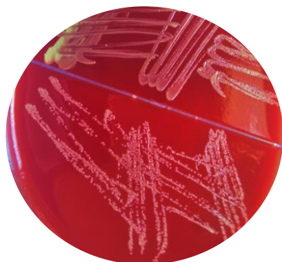
(Figure 1) Three days old blood agar plate shows the colonies of Brucella strain isolated from the patient's blood sample.

Positive blood culture bottles were cultivated onto three plates of agar media (MacConkey, blood and chocolate). After three days of aerobically incubation at 35 °C, it was noticed a growth of small tiny colonies on both blood and chocolate; whereas, no growth was detected on the MacConkey agar even after six days (Figure 1).